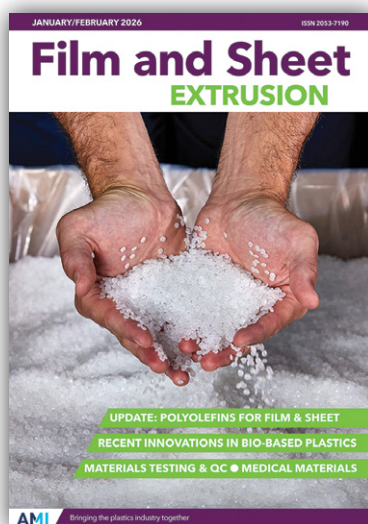
POLYOLEFINS FOR FILM AND SHEET