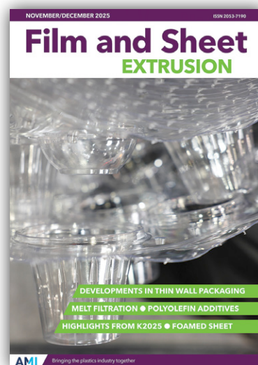
THIN WALL PACKAGING